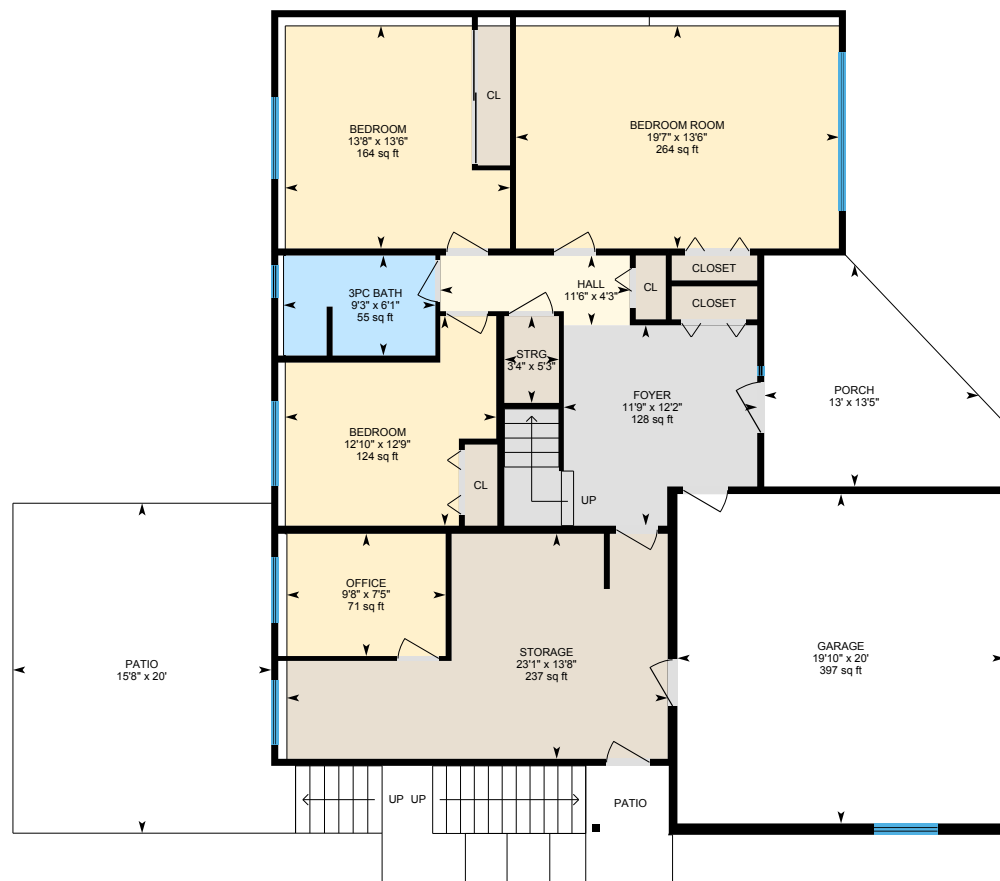
Lower Level Exterior Area 1335.20 sq ft